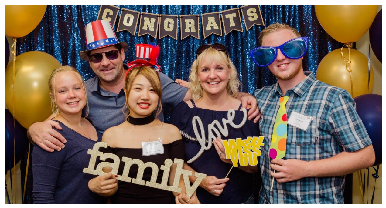
A host family & TCC Students

Thank you for choosing to participate in the Tacoma Community College (TCC) Homestay Program. Through Homestay, international students experience life in an American household as they pursue their academic goals. For those who have seen the United States only through books and movies, the program offers a rare opportunity to glimpse the ways in which real Americans live. Daily contact with hosts helps students develop conversational English skills, and the living assistance provided allows them to concentrate on their studies. Homestay students tend to do better in classes and the bonds of friendship established between hosts and students can last a lifetime.